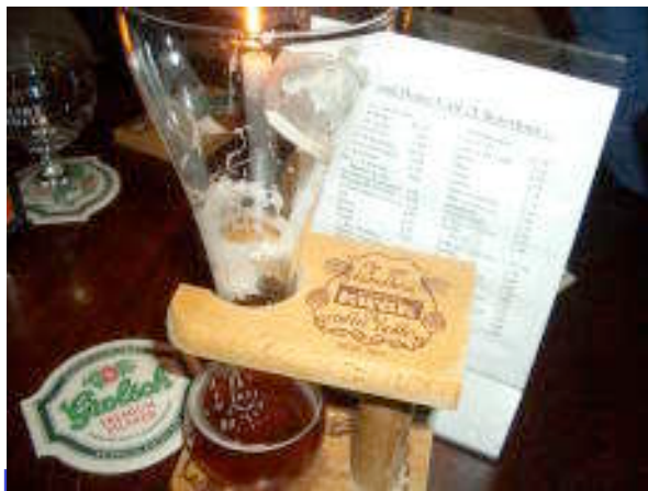
Drinking at the bar

(There are 800 kinds of beer in Belgium.)