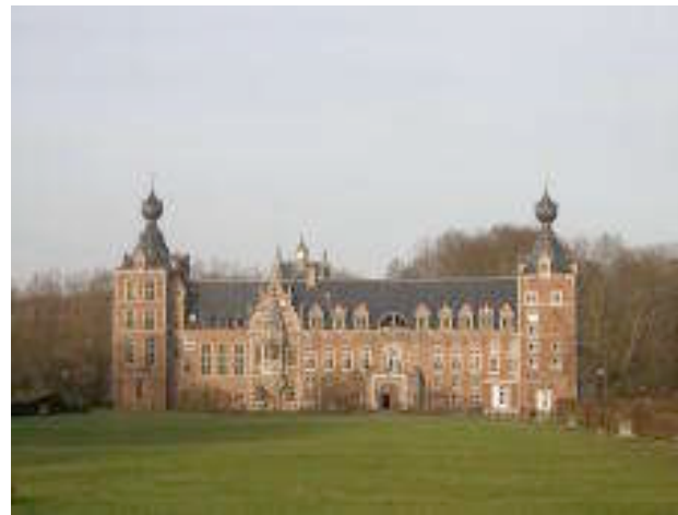
Host Institute2: KU Leuven

Through this exchange program, I realized