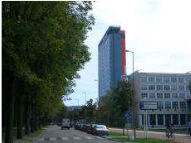
Host Institute1: TU Delft